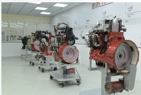
Eicher Engines are Manufactured and Marketed by TAFE Motors and Tractors Limited, under a license from Eicher Goodearth Private Limited. "EICHER" is the exclusive trademark of Eicher Goodearth Private Limited.